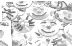
Decorated Marie biscuits