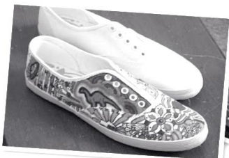
Decorated shoe or boot