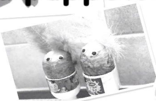
Decorated boiled egg